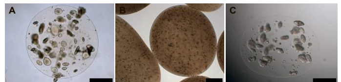
Fig. 2. Mesothelioma cells were grown for 14 days in different alginate beads. Cells grown in A (A), B (B) and C alginate (C). Scale bar = 500 \mu\text{m} .

The analysis of large cell libraries is an important process in pharmaceutical discovery and R&D, and the technology developed in this project will find application in various areas. FGen will use the NLR platform to construct patient-derived primary cell lines (Fig. 3). Such cell lines are important tools in pharmaceutical assays such as the evaluation of drug efficacy. Since these tests can be performed in modified alginates that permit 3D cell growth while mimicking the in vivo microenvironment, improved predictability of drug potency may be expected. Now that the feasibility of the NLR technology for the analysis of mammalian cell libraries has been proven, FGen plans to implement other assay formats such as screening whole genome CRISPR libraries for target identification or screening B-cells secreting antibodies toward a specific target. For the time being, FGen is mainly active in the field of industrial biotechnology and performs contract research for the engineering and screening of microbial strains. Also being able to offer services in the area of mammalian cell assay